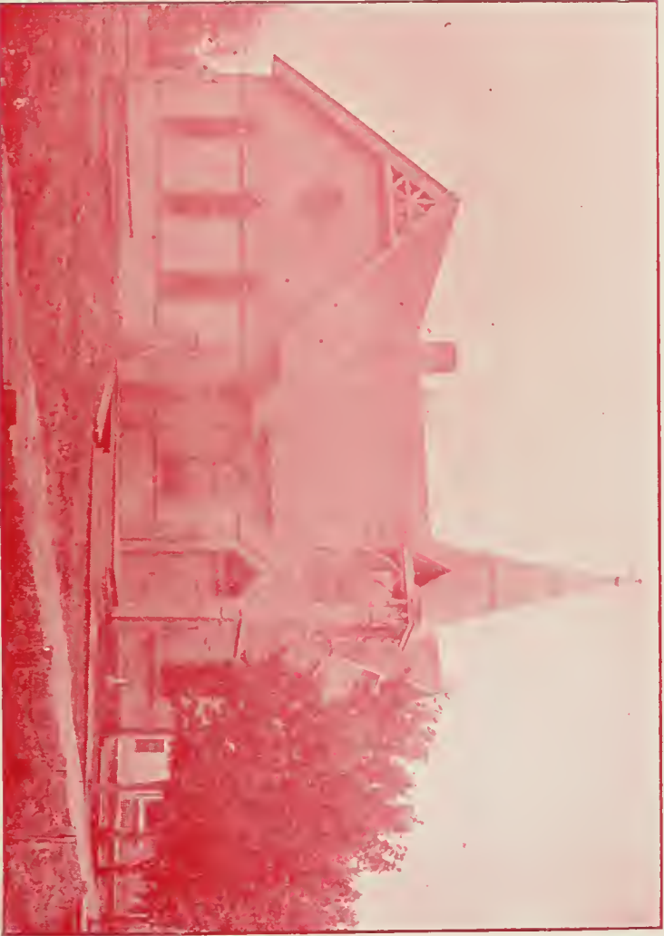
United Brethren Church, Scandia, Kansas.